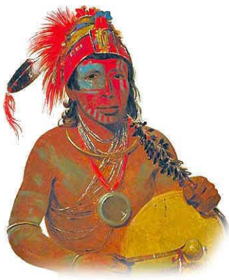
Dakota Sioux Shaman or Medicine Man