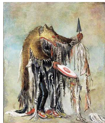
Blackfoot Shaman as a 'Skinwalker'