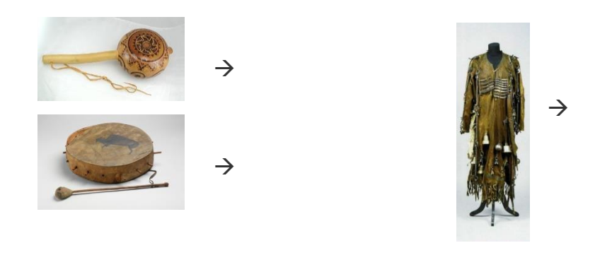
Exercice 3: Read the last paragraph. What are the Shaman's attributes?